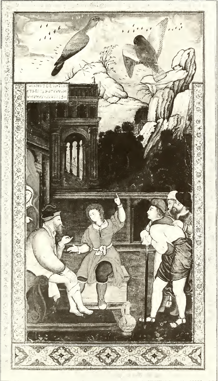
Figure 10. Joseph Interprets Pharaoh's Dream , by Kesu Das (act. 1570–1600) after Georg Pencz (German, 1500–1550). India, Mughal period, Akbar period, ca. 1585–90. Album page; opaque watercolor on paper, image: 21.4 x 10.8, folio: 42.2 x 26.5. St. Louis Art Museum, Gift of J. Lionberger Davis